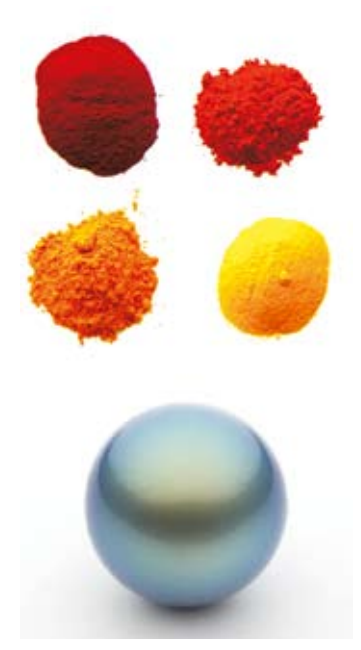
Figure 3: Top: Some brightly coloured pigments recently synthesised in our laboratories. Bottom: 'Lapis Sunlight' a recently discovered colour-travel pigment

www.merckserono.net/servlet/PB/menu/1052180/home.html