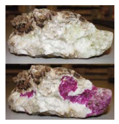
Figure 1: The mineral hackmanite from Greenland – before and after exposure to ultra-violet light

Thermochromic compounds, which change colour when heated, are well known and some recent household applications have included irons and kettles that indicate when they are hot. Other materials can change colour when exposed to sunlight or ultraviolet (UV) light, these are known as photochromic materials. One potential use of such compounds is in security marking – on, for example, banknotes or passports. At present, many pigment materials that fluoresce under UV light are used in such applications but these are becoming more widely copied by counterfeiters. Thus the search for new, smarter, colour-changing pigments continues.